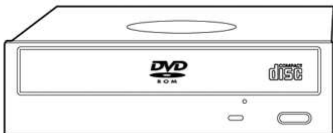
HP Half-Height SATA DVD ROM Optical Drive

The DVD ROM drive is designed to read not only CD ROM and CD R/RW discs but also DVD ROM, DVD RAM, DVD +R/RW and DVD R/RW discs.