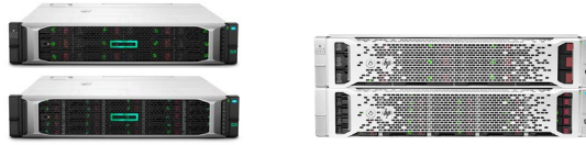
HPE D3000 Disk Enclosures