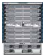
HPE StoreFabric SN8500C 8-slot Director Switch