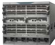
HPE StoreFabric SN8500C 4-slot Director Switch