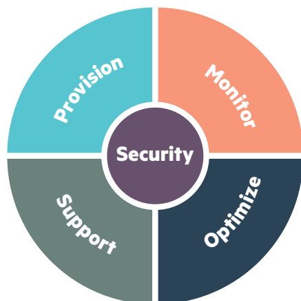
Figure 1. HPE iLO management—Core lifecycle management functions built in for instant availability

“With the ProLiant Gen10 beta we are anticipating HPE has made some unique and innovative enhancements. Automating and orchestrating server provisioning with iLO 5 will enable us to deploy and manage at scale. The Silicon Root of Trust and the Runtime Verification that check iLO and firmware for compromised code will be welcome.”