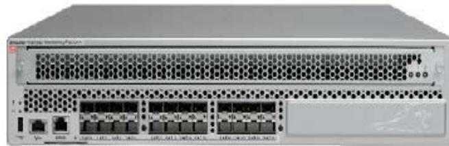
Figure 1. Brocade AMP Appliance

The Brocade Analytics Monitoring Platform (AMP) provides advanced storage telemetry, including storage device I/O performance, latency, and other SCSI metrics, across the network. Leveraging Brocade Fabric Vision technology, this platform ensures non-stop operations, identifies potential points of congestion, and maximizes end-to-end application performance. It not only provides end-to-end visibility that was not available previously, but it also improves the ROI for storage infrastructures by providing in-depth, fabric-wide metrics.