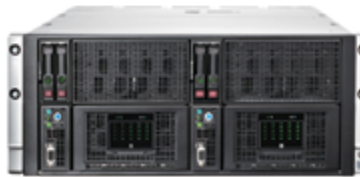
HP ProLiant SL4540 Server (2 server nodes in 4.3U Chassis)

“In comparison with the existing storage environment, we expect to operate at 1/3 of the original cost. We need four times more than our current storage capacity while still cutting cost by 2/3,” explained Mr. Ishige.