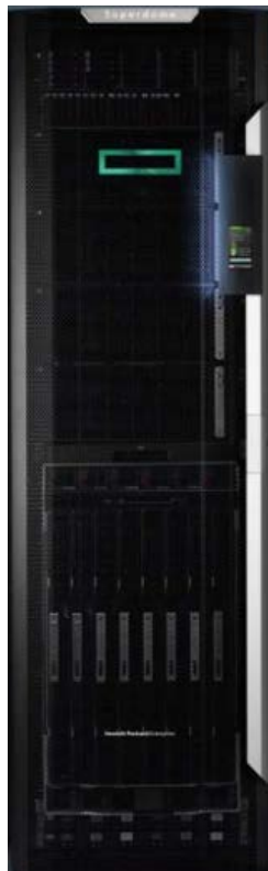
HPE Integrity Superdome 2