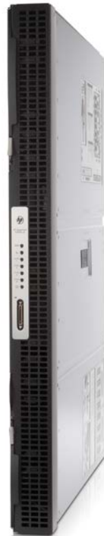
HPE Superdome 2 Server Blade (CB900s i6)