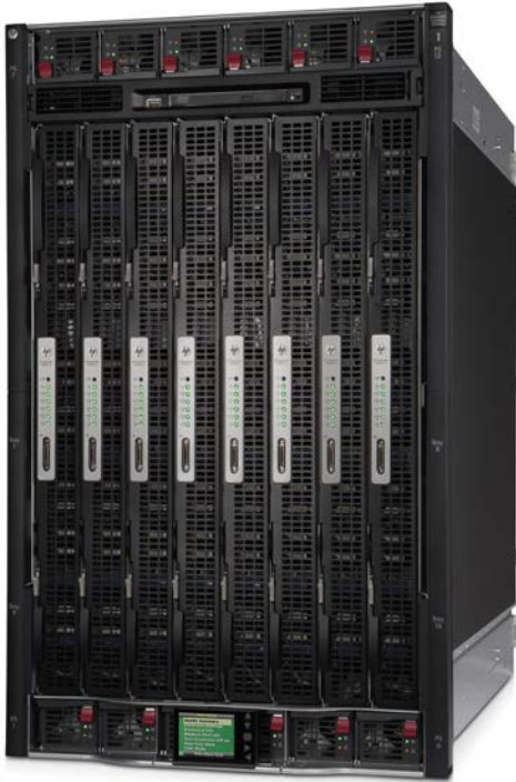
HPE Superdome 2 enclosure front