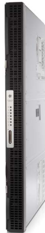
HPE Superdome 2 Server Blade (CB900s i6)