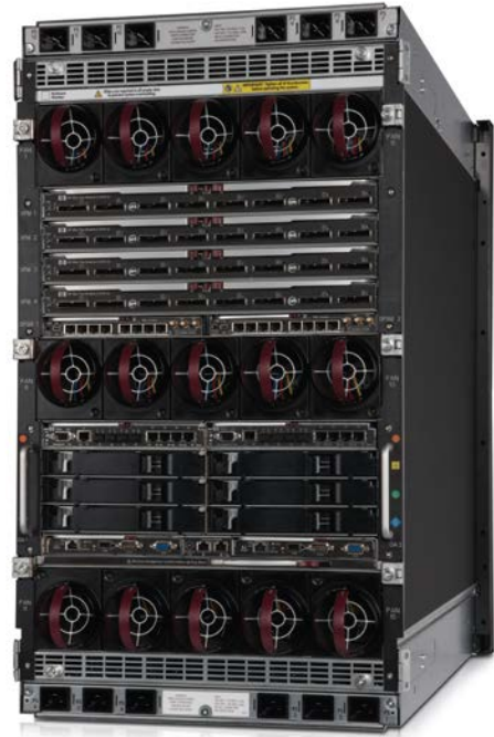
HPE Superdome 2 enclosure back