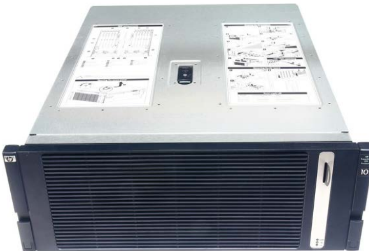
HPE Superdome 2 IOX