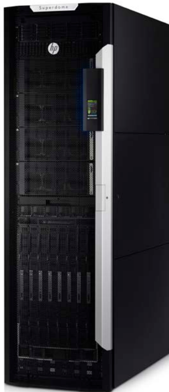
HPE Integrity Superdome 2