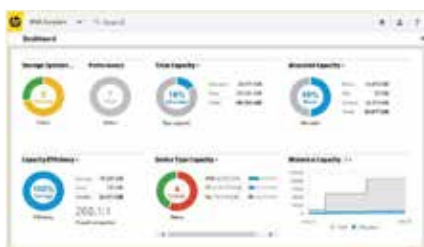
Figure 2: HPE 3PAR StoreServ Management Console dashboard

The HPE 3PAR Gen5 Thin Express ASIC seamlessly accelerates data compaction. You are empowered with one agile capacity for block volumes and file shares, freeing you from the inflexible capacity silos of pseudo-unified and islands of storage of discrete block platforms and file platforms. The addition of HPE 3PAR Adaptive and Dynamic Optimization software licenses further extend granular performance and capacity efficiency.