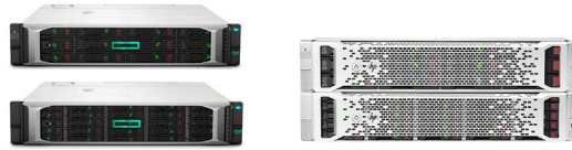
HPE D3000 Disk Enclosures